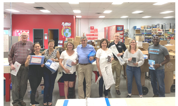
Service Above Self

THIRD FRIDAY OF EACH MONTH STARTING IN AUGUST