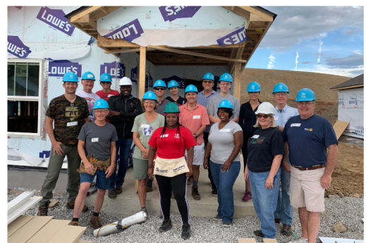
Service Above Self